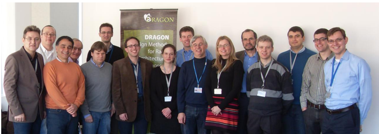
Figure 2: The DRAGON Consortium

The DRAGON consortium brings together partners and competencies from Europe's leading companies in the areas of nano electronics and wireless communications, one research institute and three universities, with radio chip designers and system experts. The consortium is covering the full design chain from customer requirements over system integration to hardware design. Top universities are included to achieve optimum innovation and move the current boundaries of the state-of-the-art. This unique combination of skills guarantees the high quality and optimal industrial exploitation of the project outcomes. This will strengthen the European telecom equipment and semiconductor industry.